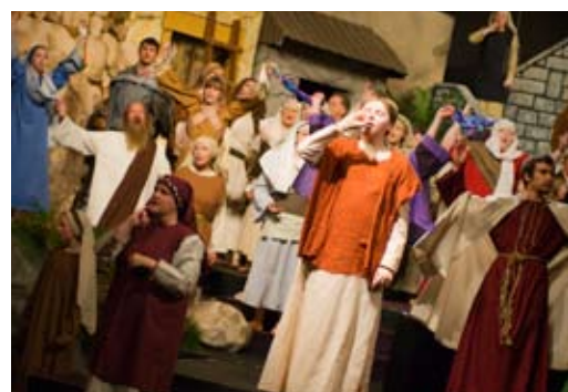
The streets of Jerusalem come alive!