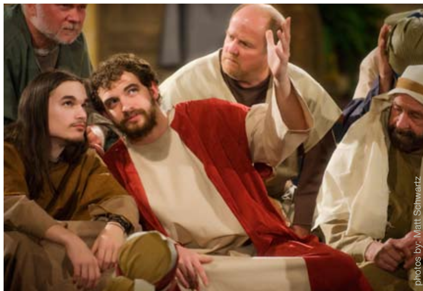
Jesus teaches his disciples.