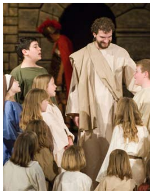
The children sing praises.

To view more photos from this year's presentation, visit jerseychurch.org and click on the photo gallery link.