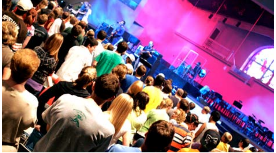
Worship on Wednesday Night